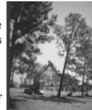
Removal of pine trees

Decision to remove 200 Pine trees from course as the Pine trees are making course maintenance difficult. The pine needles and cones are causing problems under trees.