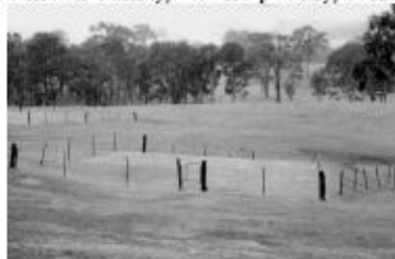
Fenced green to keep cattle off

Further action to be taken to complete the fences surrounding the remaining greens. With cattle grazing on the Richmond Park it was essential to keep the animals off the greens as they could cause much damage to the putting surface.