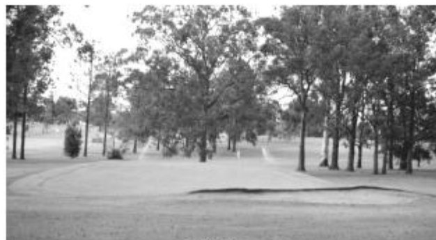
12 th Green