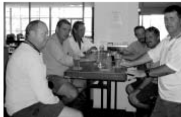
Table of Knowledge