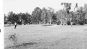
Proposed site for ponds

Members to be advised for the proposal of dams, (ponds) on 4 th and 6 th fairway to take water from Norco.