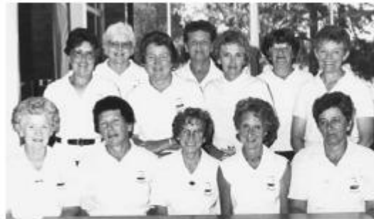
Casino Lady Golfers Committee 1990