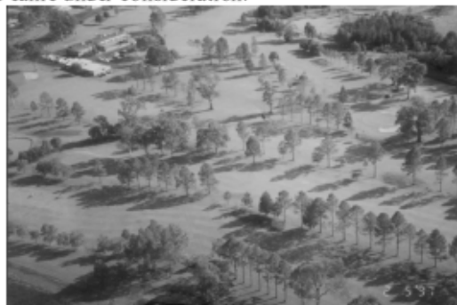
Aerial photo of bottom course and Clubhouse

In the likely closure of Norco's Dyraaba Street Milk Factory and the loss of water from that source, the possibility of obtaining water from the Casino Waste Water Treatment Works came under consideration.