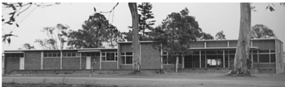
Club House 1965