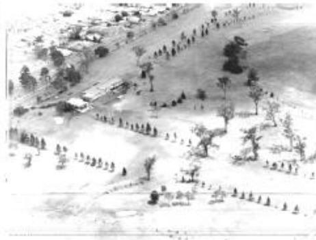
Aerial view of course

Following the approval of the Council to form links on the Park a regular nine hole was established. The following details are taken from Casino Golf Club minutes and local press cuttings.