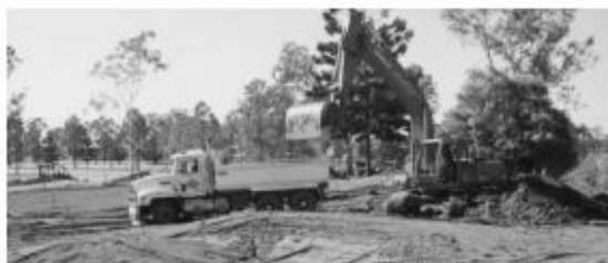
Redevelopment of 18 th green