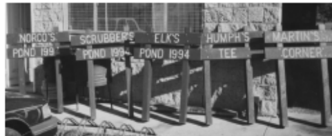
Signs ready for erection

Ponds on 4 th and 6 th fairways to be named, Elks Pond 1994, Scrubber's Pond 1994, Norco's Pond and Martin's Pond. 4 th tee named "Humphs tee", as recognition of service and contribution to the Club over a long period of time. Forward plan of Course and Club House to be developed.