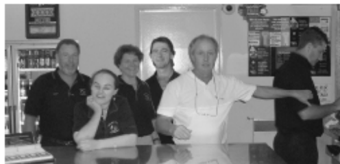
Current Bar Staff